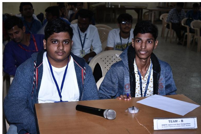
PARTICIPATING STUDENTS FROM VARIOUS INSTITUTES FROM MUMBAI AND PUNE REGION