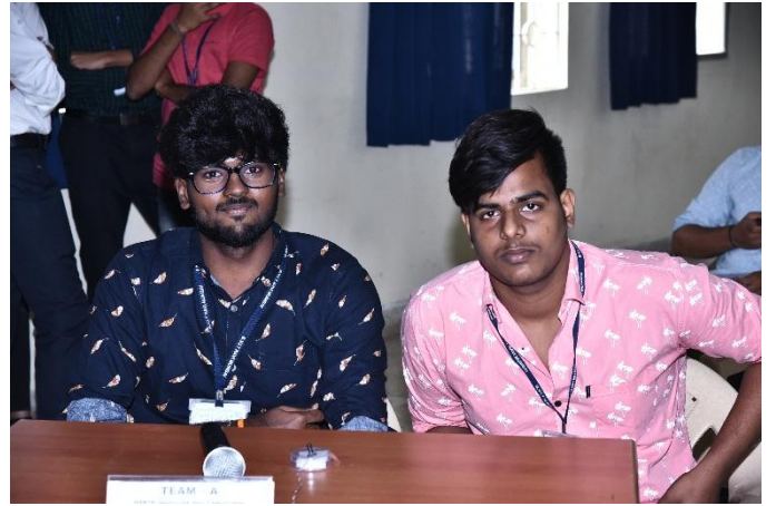
STUDENTS ANSWERING IN BUZZER ROUND