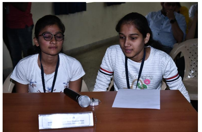
STUDENTS ANSWERING IN BUZZER ROUND