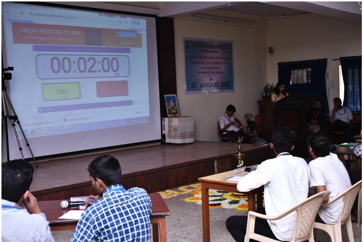
STUDENTS ANSWERING IN RAPID FIRE ROUND