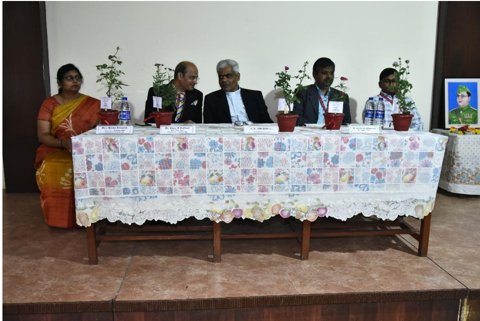
DIGNITARIES ON DAIS