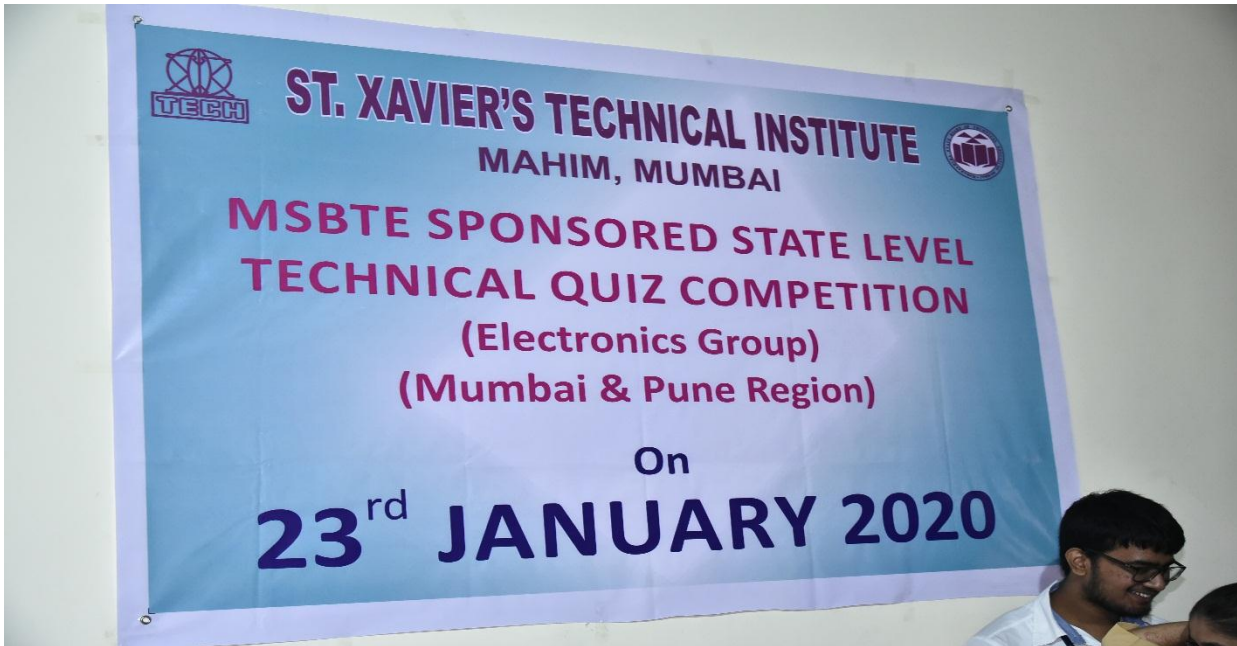
MSBTE SPONSORED QUIZ COMPETITION BANNER